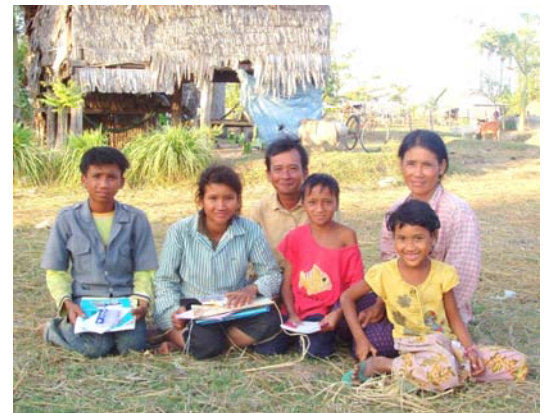
The SUN family in front of their home