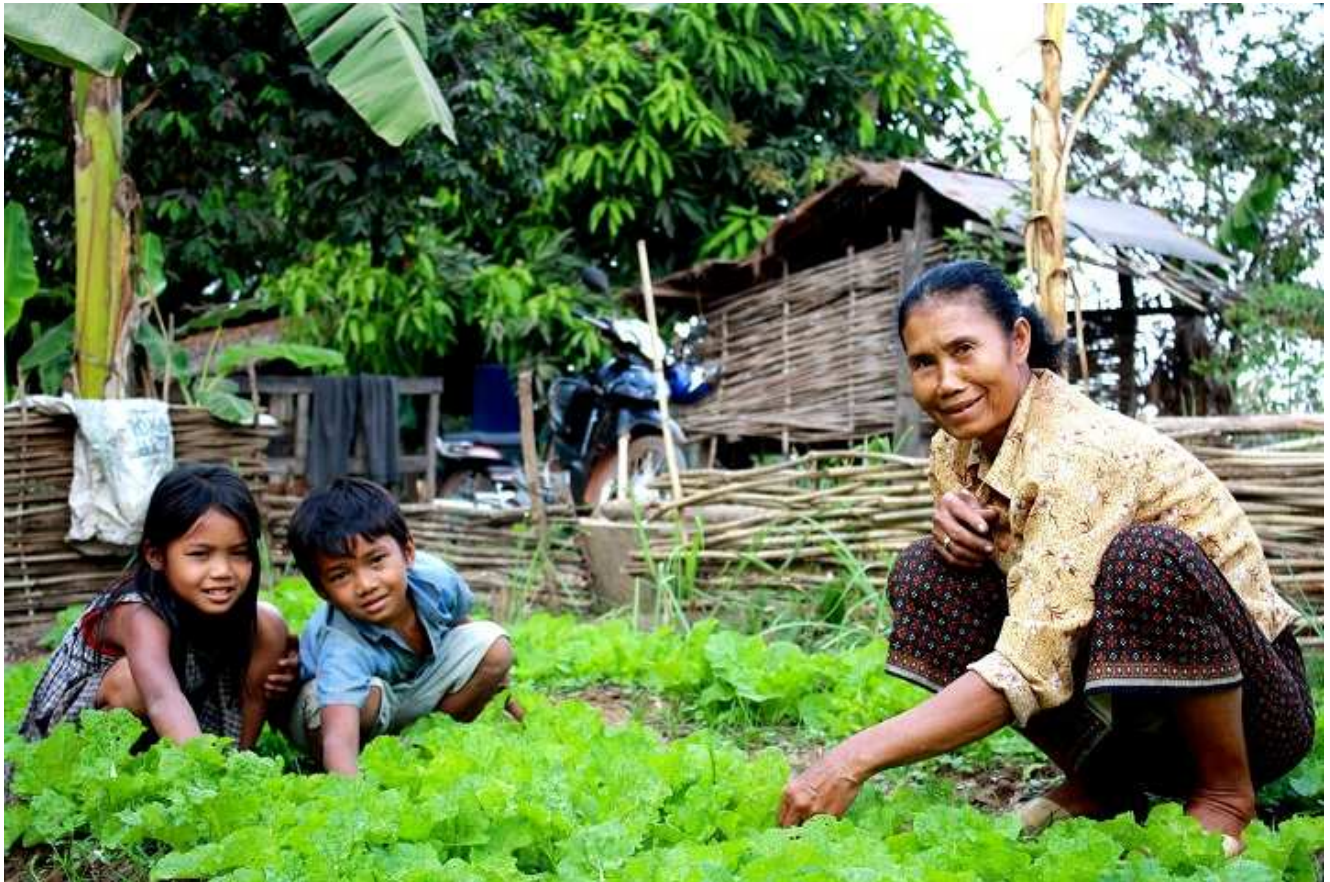
Children helping the family in the home vegetable garden

With your help, more than 385 wells are providing safe water, more than 4,500 students are currently enrolled in Sustainable Cambodia schools, and hundreds of thousands of Cambodians have been able to change their lives for the better. None of this would be happening without supporters like you!