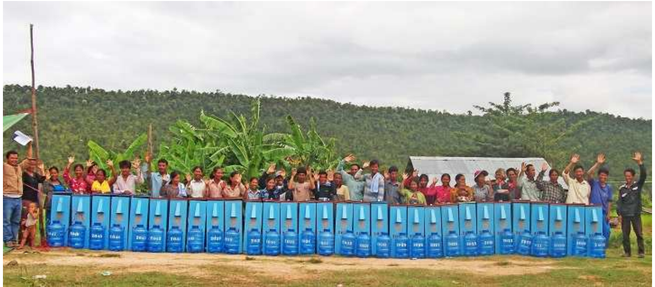
Villagers and SC staff during the distribution of the BSFs

Last month, we distributed 50 water bio-sand filters together with 50 blue water containers to 50 families in Prey O'mal.