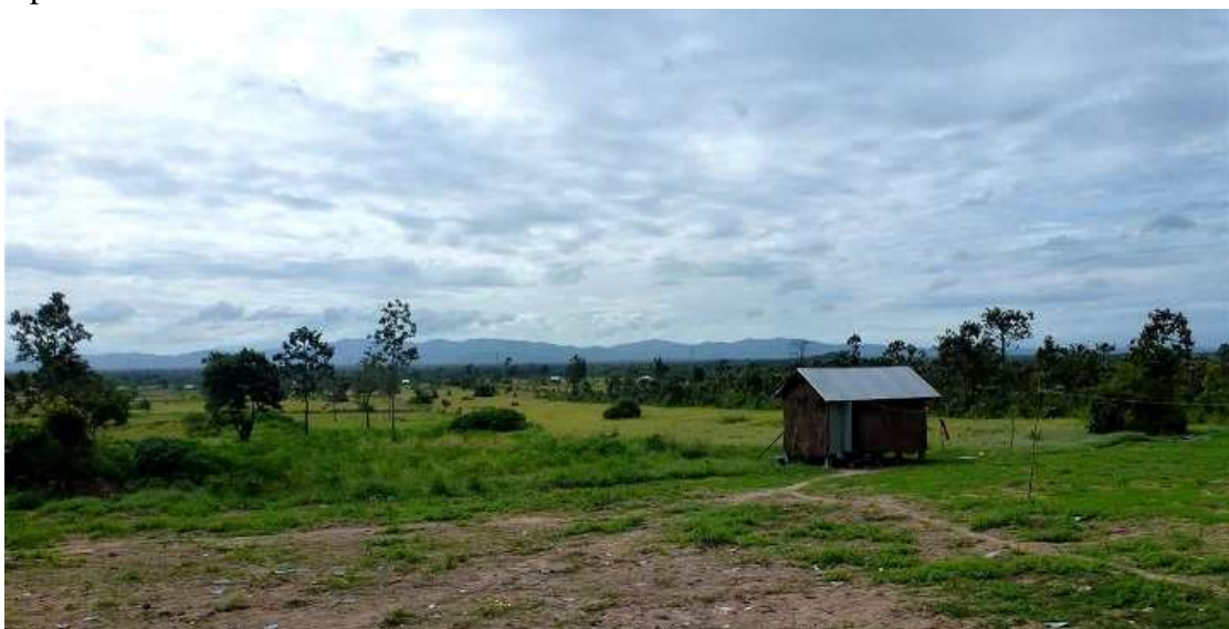
A view of the Prey O'mal village area

Prey O'mal is a very poor and remote village which is spread out over a fairly large area. Although called a "village", it actually comprises 11 smaller communities, with a total of 455 families and nearly 2,000 people.