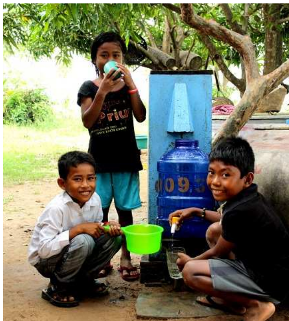
Children drinking water from the BSF at home