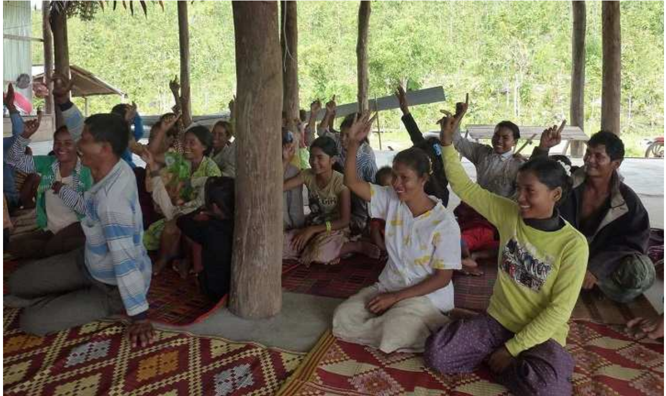
Families during the needs assessment meeting

Prey O'mal is newly settled, and the villagers are generally living at very low levels of community and economic development. A large majority of residents are subsistence farmers or day-laborers in the surrounding farmlands. A small number also finds employment in the market, but some find they must migrate to Thailand and/or other provinces in Cambodia to supplement their income while farming their own parcels of land.