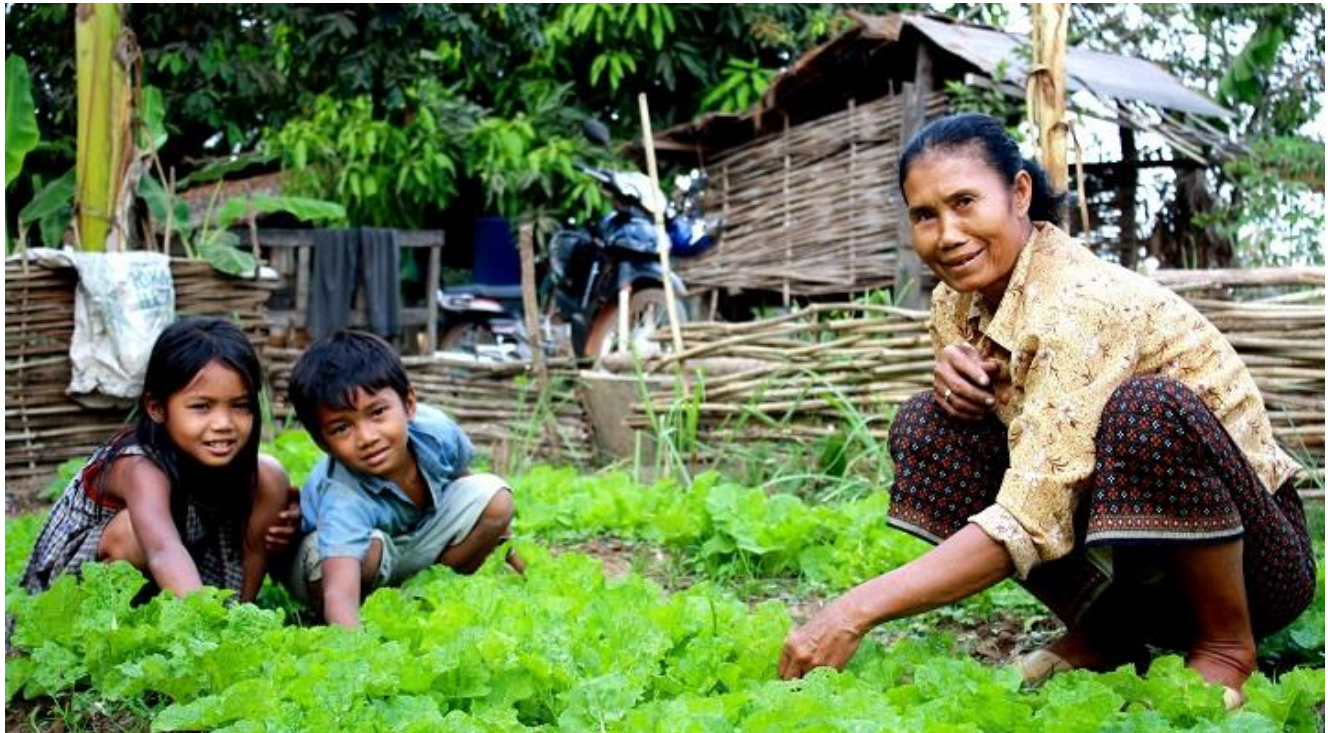
With grandchildren in their home garden from SCA

Thank you to our supporters from around the world, including our Rotarian friends from Sustainable Cambodia Australia and Rotarians from all over the globe. Thank you ALL! Everything the village families are doing to improve their quality of life is made possible by YOU.